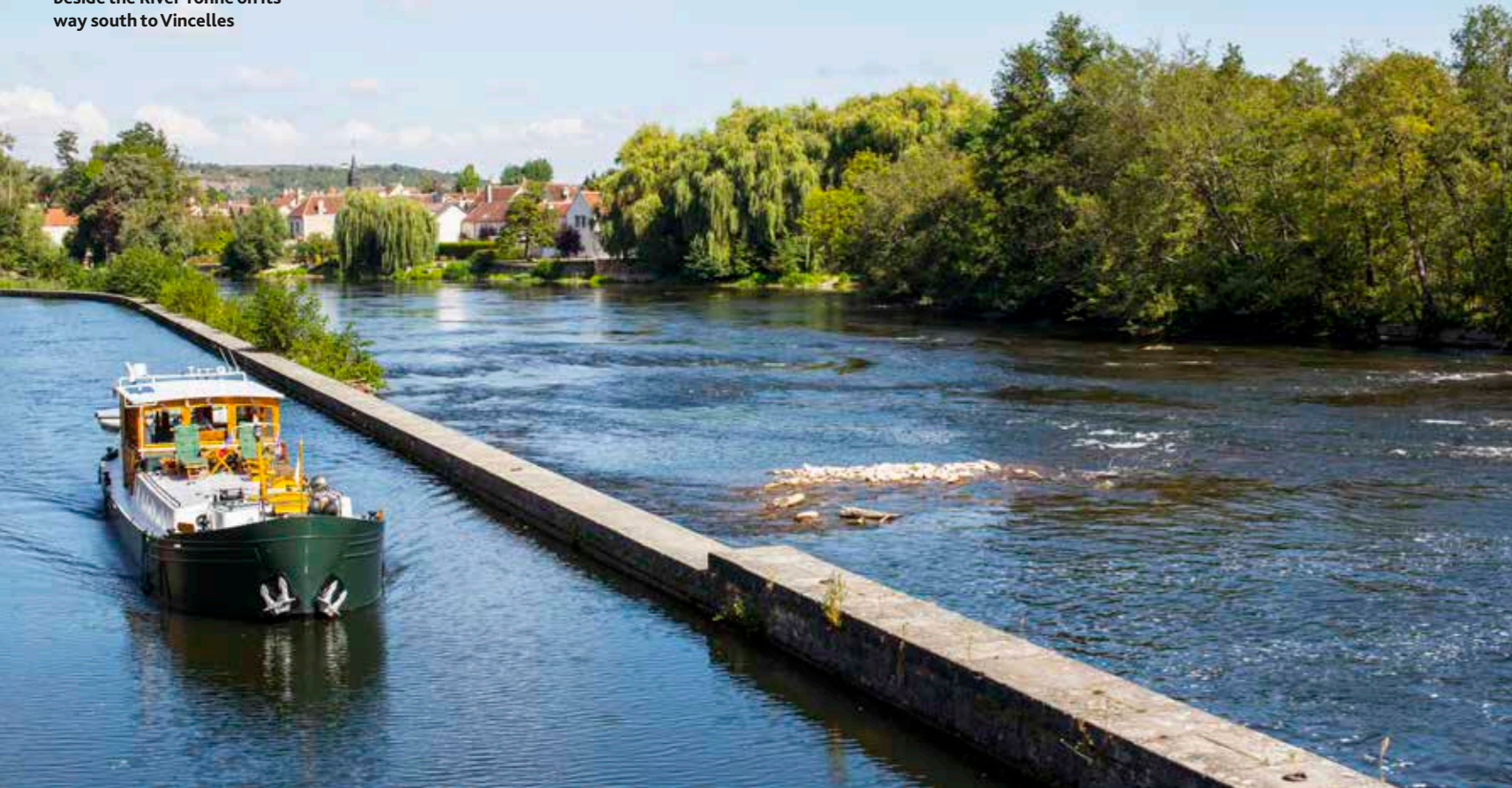
The Canal du Nivernais runs beside the River Yonne on its way south to Vincelles

We dined in the tiny and appropriately named La P'tite Beursaude – one whitewashed, wood-beamed room with a red-terracotta tiled floor – and so small it would have been easy to miss but for the blue painted door and baskets of pink geraniums outside. A waitress wearing traditional Morvan dress, with wide lace sleeves, brought us an amuse bouche of oeufs en meurette – tiny quail's eggs cooked in bourguignon sauce, and a speciality of the house. Two identical twin men, wearing identical paisley shirts, were applauded by their companions as two identical bowls of steaming snails, cooked in Chablis wine, arrived in front of them.