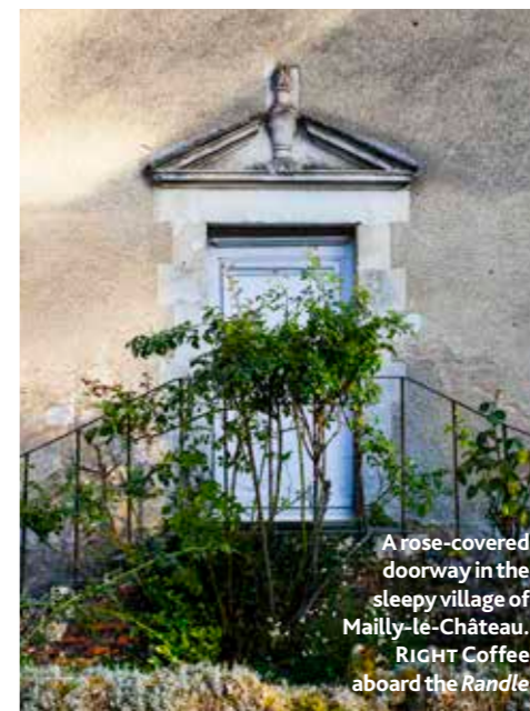
A rose-covered doorway in the sleepy village of Mailly-lé-Château. RIGHT Coffee aboard the Randle