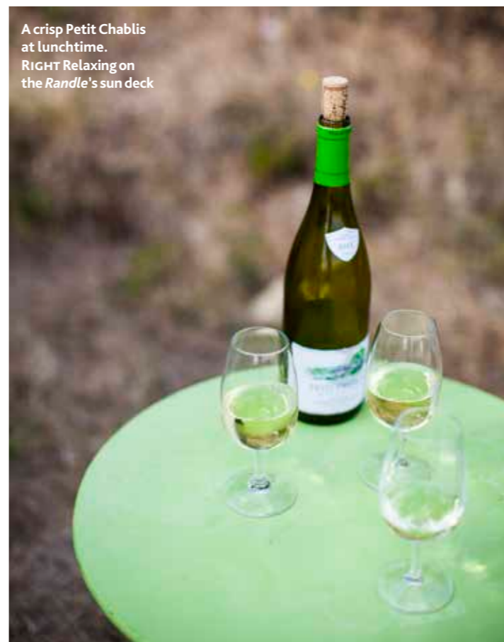
A crisp Petit Chablis at lunchtime. RIGHT Relaxing on the Randle's sun deck

Katharine and Tim swim in the lagoon below the fish ladder at Mailly-le-Château