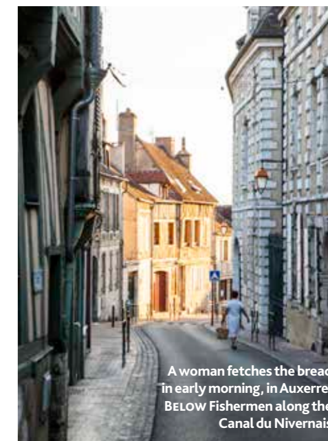
A woman fetches the bread in early morning, in Auxerre. BELOW Fishermen along the Canal du Nivernais