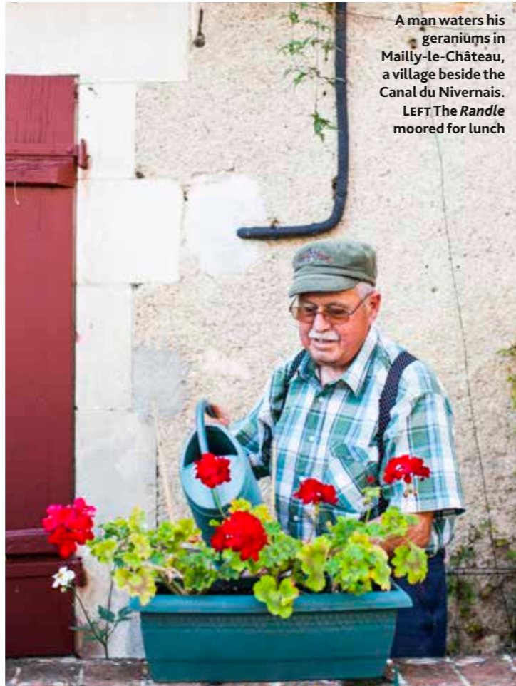
A man waters his geraniums in Mailly-le-Château, a village beside the Canal du Nivernais. LEFT The Randle moored for lunch